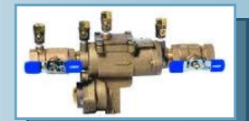
Reduced Pressure Assembly