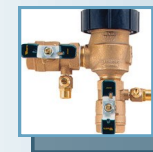
Pressure Vacuum Breaker