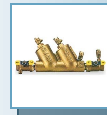
Double Check Valve Assembly

***Consult with a Contractor who is Certified to obtain a complete list of available backflow preventers.