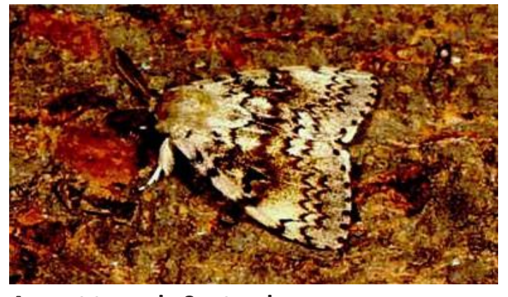
August to early September

Male adult moth is dark brown with blackish bands, forewing shape, covered with hairs from the females.