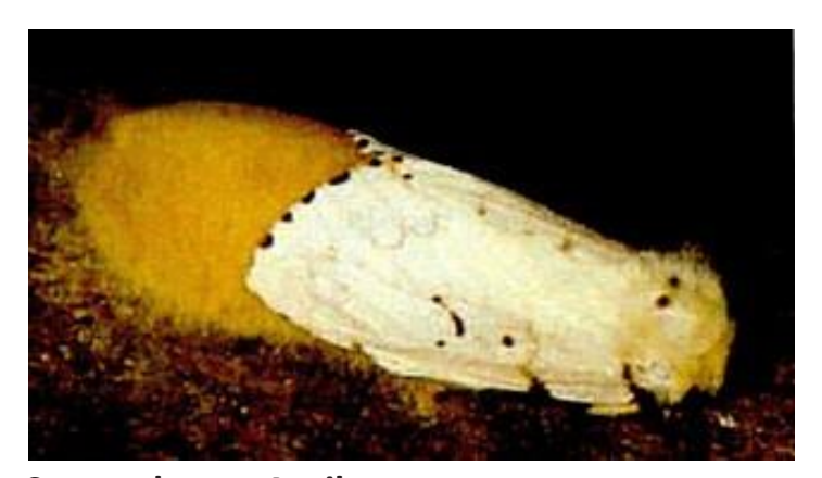
September to April

Male adult moth is dark brown with blackish bands, forewing shape, covered with hairs from the females.